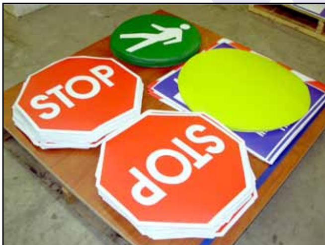
Store Decor cuts signs in various shapes with the versatile Digital Express.