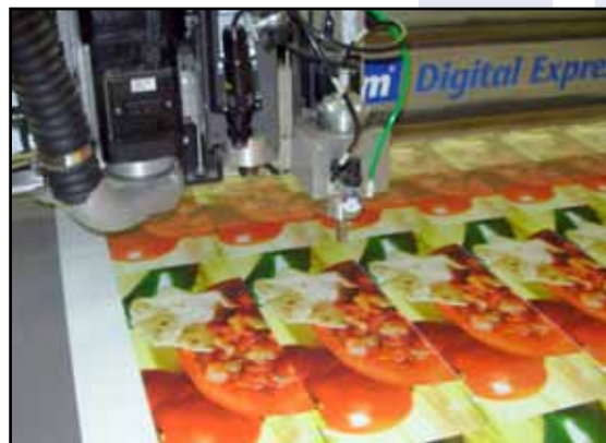
The Digital Express features MultiVision digital registration for quick and accurate alignment.