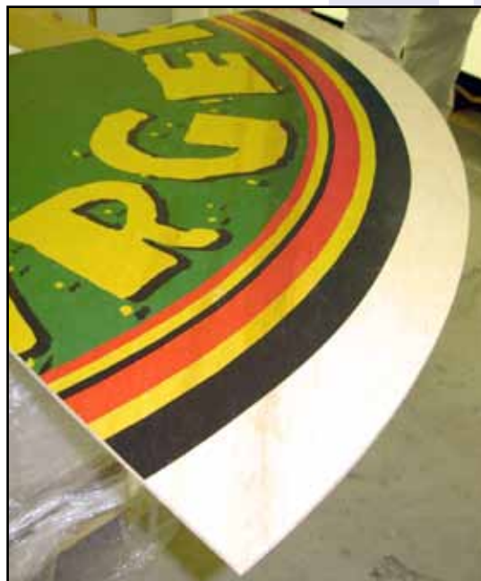
The Digital Express cut this digitally printed plywood panel easily in one pass.

1025 West Royal Lane, DFW Airport, TX 75261 Phone: 972-929-4070 • Fax: 972-929-4071 www.multicam.com • sales@multicam.com